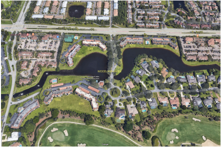
Built in 1977/1980 - 120 units - 4 floors

Woodland Lakes Homeowners Association Address: 5345 Woodland Lakes Dr, Palm Beach Gardens, FL 33418 Phone: +1 561-622-0500