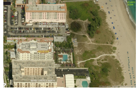
Built in 2009 - 34 units - 6 floors

Dolce Vita Condominium Association Address 151 S Ocean Ave Palm Beach Shores, FL 33404-5761 Phone Number 561-855-6062