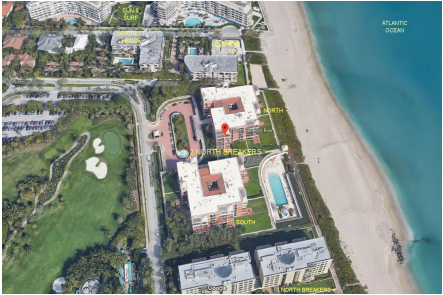
Built in 1986 - 47 units - 5 floors

Breakers Row Address: 2 N Breakers Row, Palm Beach, FL 33480 Phone: +1 561-659-2488