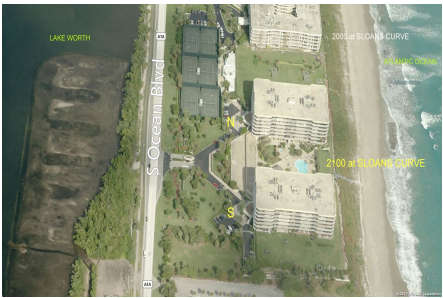
Built in 1980 - 95 units - 6 floors

The Residences At Sloans Curve Inc, 18 Sloans Curve Drive Palm Beach, FL 33480 Phone: (561) 582-1203