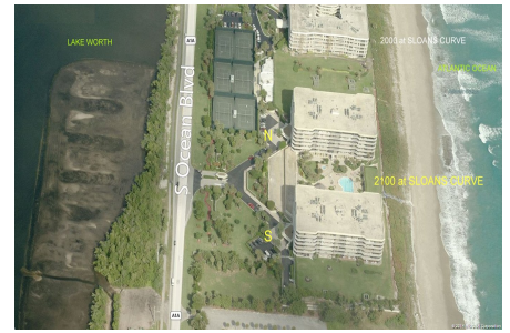
Built in 1980 - 95 units - 6 floors

The Residences At Sloans Curve Inc, 18 Sloans Curve Drive Palm Beach, FL 33480 Phone: (561) 582-1203