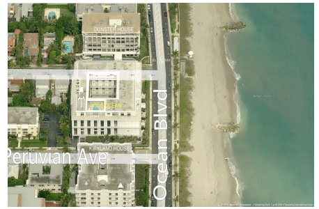
Built in 1965 - 60 units - 5 floors

400 Association Address: 400 S Ocean Blvd, Palm Beach, FL 33480 Phone:+1 561-655-5470