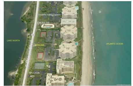
Built in 1979 - 106 units - 7 floors

The Atriums Of Palm Beach Condo 3400 South Ocean Boulevard Palm Beach, FL 33480 Phone: (561) 586-0005