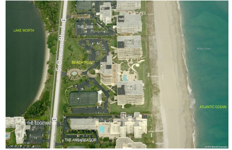
Built in 1979 - 105 units - 7 floors

Beach Point Condominium Association Inc, 2660 S Ocean Blvd, Palm Beach, FL 33480 - Phone: (561) 586-2648