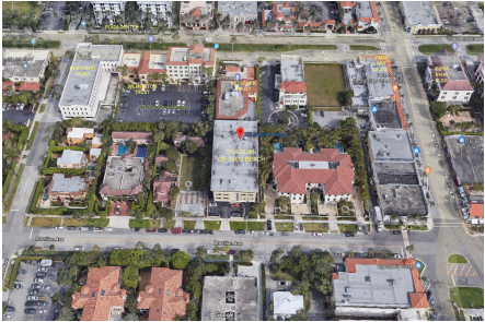
Built in 1970 - 24 units - 4 floors