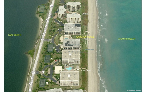
Built in 1982 - 69 units - 5 floors

Carlton Place Condominium Association Inc, 3140 South Ocean Boulevard Office 107S Palm Beach, FL 33480 Phone: (561) 582-7117