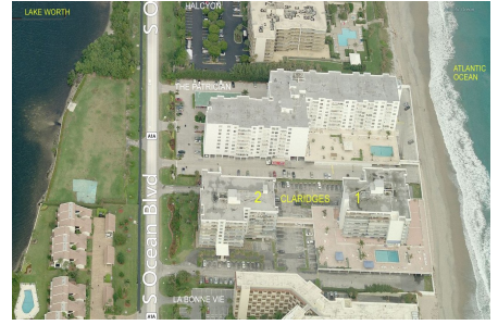
Built in 1973 - 111 units - 8 floors

Claridges Condominiums Inc 3460 S Ocean Blvd Palm Beach, FL 33480 tel : +1 561-585-4245