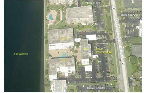
Built in 1975 - 79 units - 5 floors

The Cove Condominium The Cove Condominium 2784 South Ocean Blvd Palm Beach, FL 33480 (561) 585-6060 http://www.thecovecondominium.com/