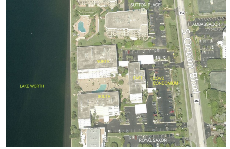
Built in 1975 - 79 units - 5 floors

The Cove Condominium The Cove Condominium 2784 South Ocean Blvd Palm Beach, FL 33480 (561) 585-6060 http://www.thecovecondominium.com/