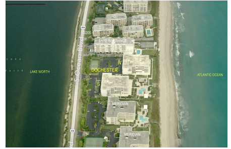
Built in 1979 - 100 units - 5 floors

The Dorchester of Palm Beach Condominium Association 3250 South Ocean Boulevard Palm Beach, FL 33480 561-586-3304 http://www.dorchesterpalmbeach.com/outside_home.asp