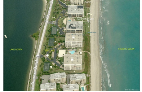
Built in 1985 - 72 units - 7 floors

Number of units: 72 Number of active listings for rent: 0 Number of active listings for sale: 5 Building inventory for sale: 6% Number of sales over the last 12 months: 5 Number of sales over the last 6 months: 1 Number of sales over the last 3 months: 1