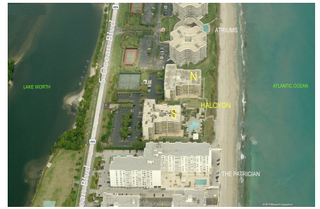
Built in 1980 - 104 units - 7 floors

Halcyon Of Palm Beach The Condominium Management 3440 S Ocean Blvd, Palm Beach, FL 33480 (561) 582-3952