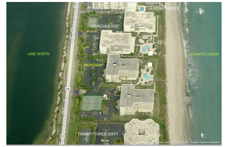
Built in 1981 - 79 units - 5 floors

Meridian Of Palm Beach Condominium Association Inc 3300 South Ocean Boulevard Palm Beach, FL 33480 Phone: (561) 582-9830