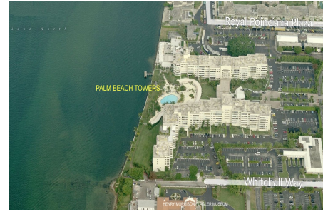
Built in 1956 - 258 units - 6 floors

Palm Beach Towers Condominium Association, 44 Cocoanut Row Palm Beach, FL 33480 - Phone: (561) 832-8511