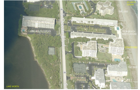
Built in 1979 - 42 units - 7 floors

Palm Beach Stratford Condo Association Inc, 2580 S Ocean Blvd, Palm Beach, FL 33480 Phone: (561) 586-0124