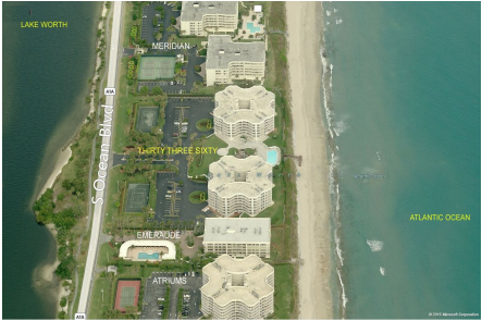
Built in 1980 - 89 units - 6 floors

The Thirty-Three Sixty Condo Association Of Palm Beach Inc,3360 Condominium Association 3360 South Ocean Boulevard Palm Beach, FL 33480 Phone: (561) 585-4504