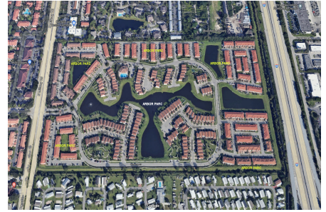
Built in 2007/2022 - 446 units - 2 floors

Arbor Parc Address: 4054 Woods Edge Cir, Riviera Beach, FL 33410 Phone: +1 561-964-1550 http://arborparc-mediterranea.com/