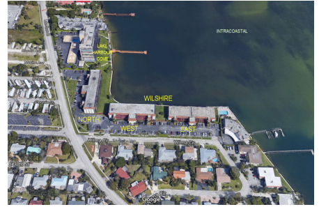
Built in 1972 - 30 units - 3 floors

Wilshire Condominium Association Inc 410 Wilma Circle Apartment 306 Riviera Beach, FL 33404 Phone: (561) 842-7475