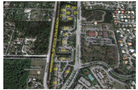
Built in 2004 - 166 units - 3 floors

Kensington of Royal Palm Beach c/o GRS Management Associates 3900 Woodlake Blvd. Suite 309 Lake Worth, FL 33463 TEL: 561-641-8554 FAX: 561-641-9448 https://www.grsmgt.com/association/kensington/