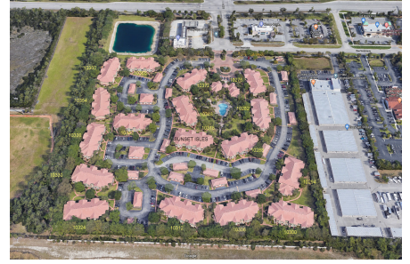
Built in 1999 - 232 units - 2 floors