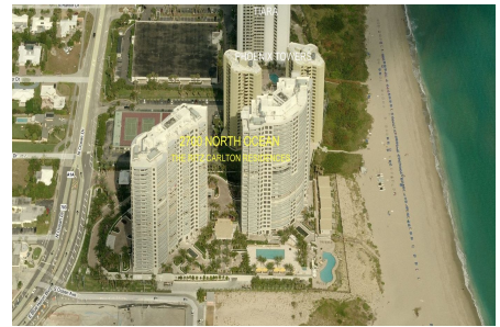
Built in 2008 - 242 units - 26 floors

The Ritz-Carlton Residences 2700 North Ocean Drive, Singer Island-Riviera Beach, FL 33404 561-259-2700 http://www.theresidencespalmbeach.com/