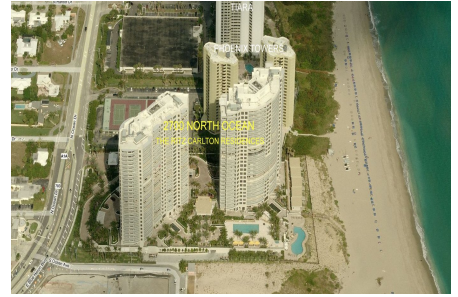
Built in 2008 - 242 units - 26 floors

Number of units: 242 Number of active listings for rent: 5 Number of active listings for sale: 4 Building inventory for sale: 1% Number of sales over the last 12 months: 9 Number of sales over the last 6 months: 5 Number of sales over the last 3 months: 0