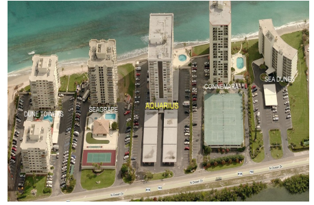
Built in 1974 - 112 units - 17 floors

AQUARIUS CONDOMINIUM INC 5440 N. Ocean Drive Singer Island, FL 33404 Tel: (561)842-7611