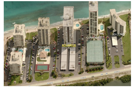
Built in 1974 - 112 units - 17 floors

AQUARIUS CONDOMINIUM INC 5440 N. Ocean Drive Singer Island, FL 33404 Tel: (561)842-7611