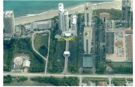
Built in 2007 - 59 units - 20 floors

Beachfront At Singer Island 4600 N Ocean Dr, Riviera Beach FL 33404 (561) 844-4647