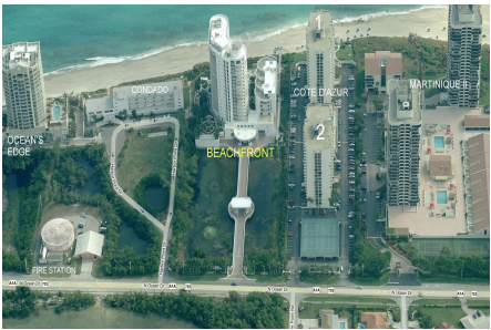
Built in 2007 - 59 units - 20 floors

Beachfront At Singer Island 4600 N Ocean Dr, Riviera Beach FL 33404 (561) 844-4647