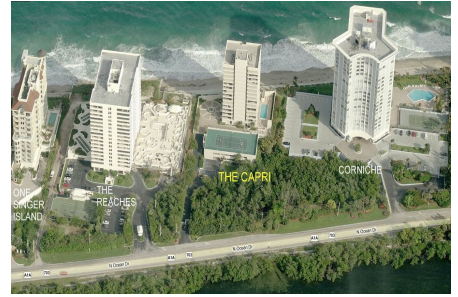
Built in 1985 - 28 units - 14 floors

Capri Of Singer Island Condominium Association Inc 5250 N Ocean Drive Riviera Beach, FL33404-2657 (561) 842-0293