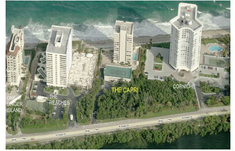
Built in 1985 - 28 units - 14 floors

Capri Of Singer Island Condominium Association Inc 5250 N Ocean Drive Riviera Beach, FL33404-2657 (561) 842-0293