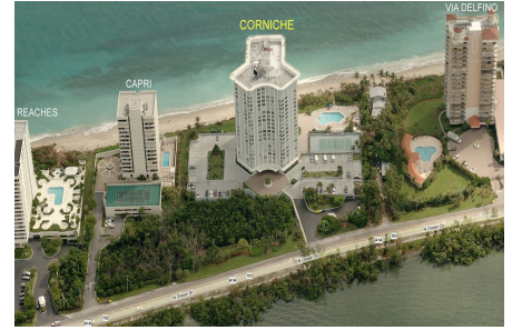
Built in 1982 - 110 units - 22 floors

CORNICHE CONDOMINIUM ASSOCIATION INC 5200 N OCEAN DR WEST PALM BEACH, FL 33404-2659 (561) 848-3911