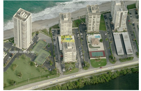
Built in 1972 - 80 units - 11 floors

Dunes Towers Association Inc 5480 N Ocean Drive # Assoc Singer Island, FL33404-2554 (561) 848-8740