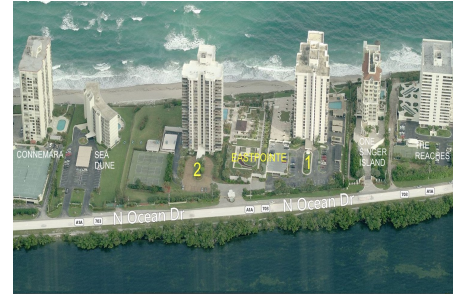
built in 1975 - 147 units - 23 floors

Eastpoint Condominium Association, Inc 5380 N Ocean Drive Riviera Beach, FL 33404-2515 (561) 842-6771