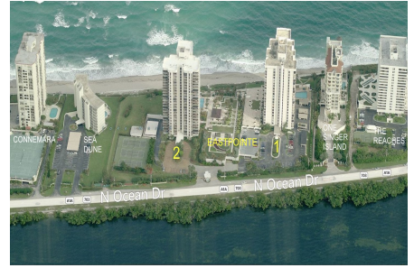
built in 1975 - 147 units - 23 floors

Eastpoint Condominium Association, Inc 5380 N Ocean Drive Riviera Beach, FL 33404-2515 (561) 842-6771