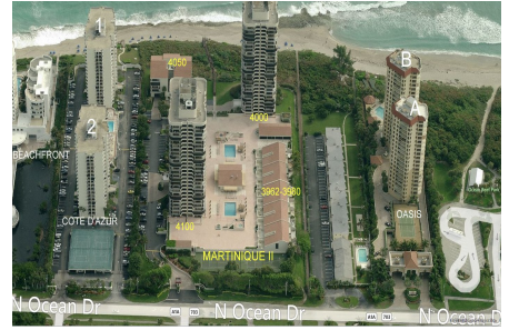
Built in 1986 - 220 units - 26 floors

Martinique 2 Owners Association Inc 4100 N Ocean Drive Apartment 102 Riviera Beach, FL 33404-2851 (561) 848-8208 http://www.martiniqueii.com/outside_home.asp