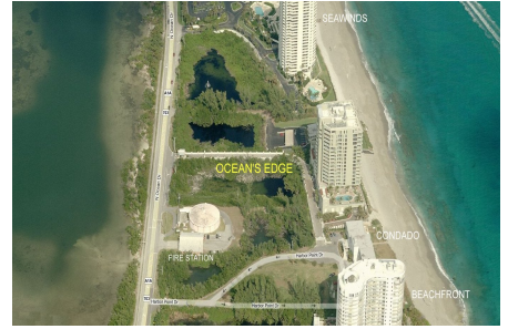
Built in 2008 - 40 units - 18 floors

Ocean Edge At Singer Island 5050 N Ocean Dr Riviera Beach, FL33404 (561) 881-9510