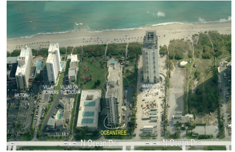
Built in 1978 - 146 units - 20 floors

Ocean Tree Condominium Association 3400 N Ocean Drive Apartment 107 West Palm Beach, FL 33404-3201 (561) 845-6050