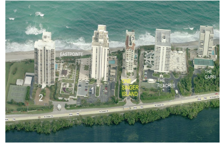
Built in 2006 - 15 units - 12 floors

One Singer Island Condo Association 5310 North Ocean Drive Riviera Beach, FL 33404 561-844-0580