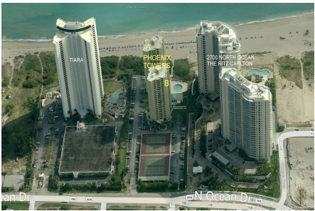
Built in 1973 - 175 units - 24 floors

Phoenix Towers Condominium 2800 N Ocean Dr, Riviera Beach, FL 33404, Phone:(561) 844-8623