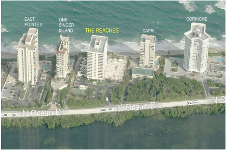
Built in 1981 - 94 units - 17 floors

Reaches Condominium Association 5280 N Ocean Drive Riviera Beach, FL 33404-2660 (561) 844-5280