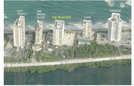
Built in 1981 - 94 units - 17 floors

Reaches Condominium Association 5280 N Ocean Drive Riviera Beach, FL 33404-2660 (561) 844-5280