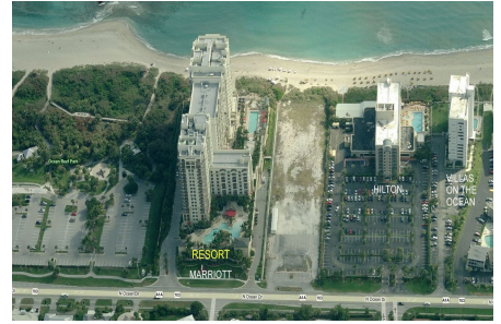
Built in 2007 - 305 units - 21 floors

Palm Beach Marriott Singer Island Beach 3800 North Ocean Drive,Singer Island Riviera Beach, FL 33404 561-340-1700