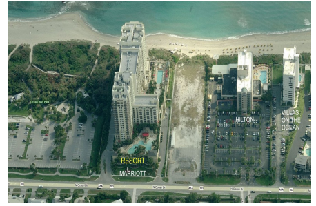
Built in 2007 - 305 units - 21 floors

Palm Beach Marriott Singer Island Beach 3800 North Ocean Drive, Singer Island Riviera Beach, FL 33404 561-340-1700