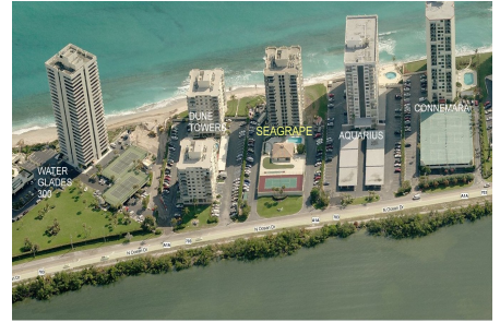
Built in 1973 - 60 units - 16 floors

Sea Grape Tower Assn Inc 5460 N Ocean Drive Riviera Beach, FL33404-2548 (561) 848-0969