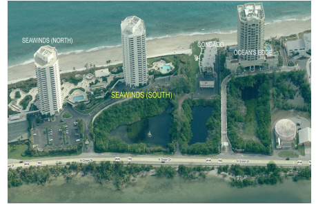
Built in 1983 - 93 units - 24 floors

Seawinds South Condominium Association Inc, 5070 N Ocean Drive West Palm Beach, FL33404 (561) 863-7268 Admin email Seawindsadmin@comcast.net Mgr email Seawindsmanager@comcast.net http://www.seawindssingerisland.com/seawindspoa/outside_home.asp