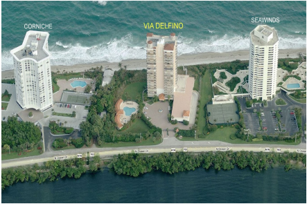
Built in 2003 - 33 units - 20 floors

Via Delfino Condominium 5150 N Ocean Drive Riviera Beach FL33404 (561) 841-8500