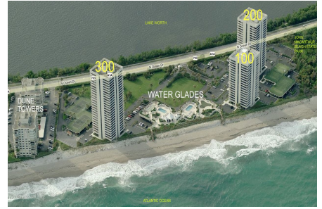
Built in 1975 - 84 units - 22 floors

Water Glades 200 Condominium Association, Inc. 5540 North Ocean Drive Singer Island FL 33404 (561) 845-2380 WaterGlades@comcast.net http://watergladescondo.com/outside_home.asp