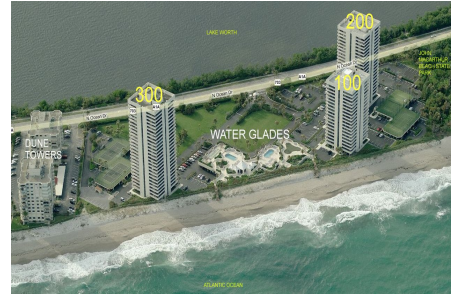
Built in 1975 - 100 units - 26 floors

Water Glades 300 Condominium Association, Inc. 5540 N Ocean Drive Singer Island FL 33404 (561) 845-2380 WaterGlades@comcast.net http://watergladescondo.com/outside_home.asp