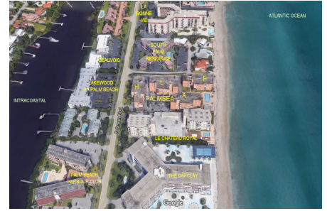
Built in 1973 - 121 units - 5 floors