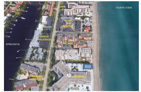
Built in 1973 - 121 units - 5 floors