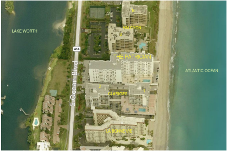
Built in 1971 - 211 units - 8 floors

Patrician The of Palm Beach 3450 S Ocean Blvd Palm Beach, FL 33480 Phone: 561-588-4313