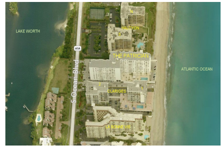
Built in 1971 - 211 units - 8 floors

Patrician The of Palm Beach 3450 S Ocean Blvd Palm Beach, FL 33480 Phone: 561-588-4313