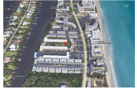
Built in 1974 - 128 units - 5 floors

Southgate Condominium Association Inc 3605 South Ocean Boulevard Office South Palm Beach, FL 33480 (561) 588-0153