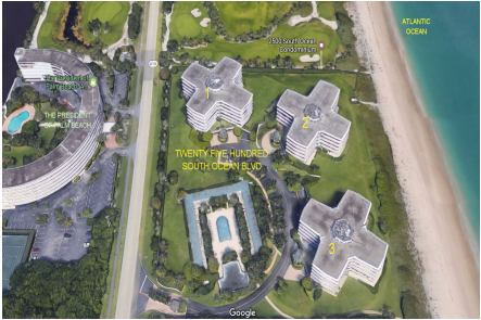
Built in 1981 - 60 units - 5 floors

2500 South Ocean Blvd Condominium Association Inc 2500 South Ocean Boulevard Office Palm Beach, FL 33480 Phone: (561) 586-5911