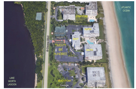
Built in 1977 - 81 units - 5 floors

2600 Condo Address: 2600 S Ocean Blvd, Palm Beach, FL 33480, Phone:+1 561-585-3189