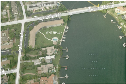
Built in 1966 - 35 units - 2 floors

White Hall Condominiums Property Manager 561-427-0681 561.427.0696 http://bristolmanagement.com/forms/Whitehall/whitehall.htm