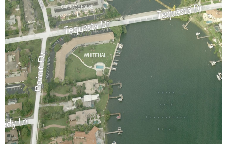
Built in 1966 - 35 units - 2 floors

White Hall Condominiums Property Manager 561-427-0681 561.427.0696 http://bristolmanagement.com/forms/Whitehall/whitehall.htm