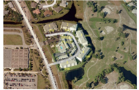
Built in 2005 - 112 units - 3 floors