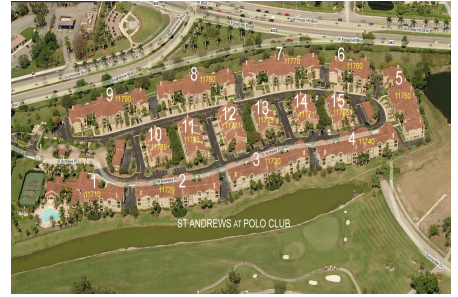
Built in 2004 - 200 units - 3 floors

St Andrews At The Polo Club Condominium Association 11360 Fortune Circle # E6a Wellington, FL33414-8778 (561) 296-1527