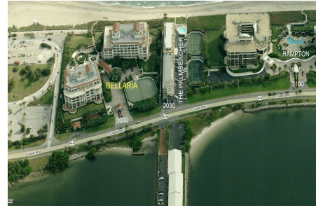
Built in 2006 - 36 units - 6 floors

Bellaria Condominium 561.540.2505 manager@bellariacondo.com http://bellariacondo.com